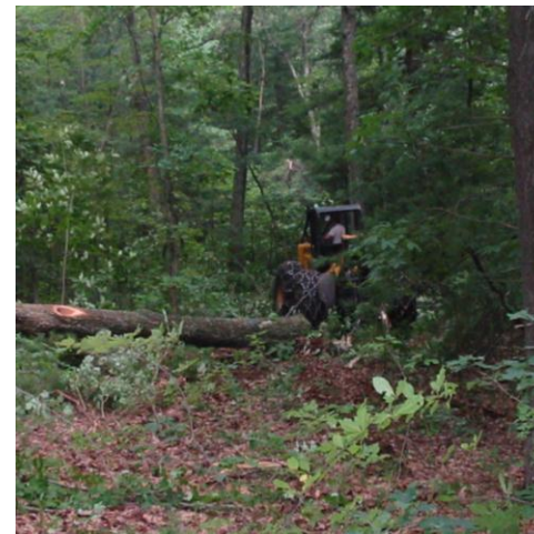
Log skidding, August 2004

Skid path. Modern foresters manage harvesting operations to minimize the disturbance of soils. When trees are cut and delimbed, they must be transported to the landing – a process called “skidding.” The paths that are used to skid logs to landings are particularly susceptible to wear and tear, so loggers must employ Best Management Practices to reduce soil erosion and protect water quality. These practices include, but are not