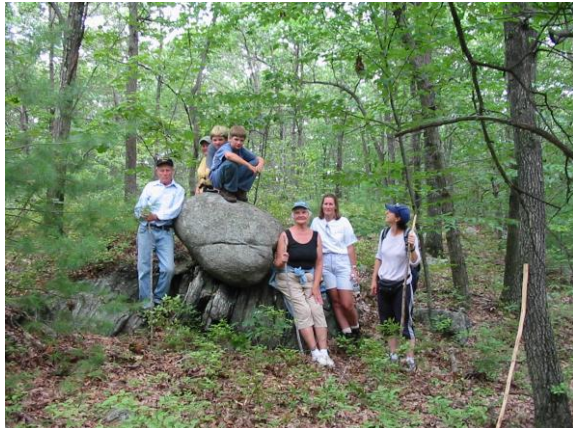
Glacial Erratic & Hikers

Glacial erratic on bedrock outcrop. This granite boulder, a glacial erratic, was transported by the last continental glacier from the north and settled on this bedrock outcrop as the ice melted. The bedrock shows the vertical cleavage (fracturing) that characterizes bedrock in this region. The rocks, originally sediments in an ocean, were compressed and distorted during deep burial below a mountain range as continental plates were colliding in this area approximately 350-400 million years ago. The thin soils support an oak forest of generally smaller trees than the thicker soils at the south and east sides of the property.