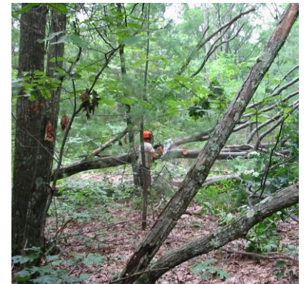
Harvesting, August 2004

Forest management and harvesting. This area was harvested for timber and firewood in 2004. While specific forestry prescriptions differ from property to property, the most appropriate management practices for this forest included leaving a few strong, healthy trees. These harvests accomplish at least three objectives; focusing the site's growth potential on stronger trees, putting sunlight on the forest floor to allow new trees to start growing, and providing some income to the landowner. In addition, the slash provides cover for small animals. The forest will be mature enough for another harvest in 10 to 20 years.