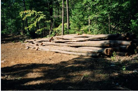
Log landing in 2004

Log Landing. The area to the south served as a landing for timber harvest from both this property in 2004 and from an adjoining private property in 2005. Several logs of various lengths that were not suitable for lumber were culled and left in low piles. These trunks are slowly rotting but will be evident for at least another 20 years. Immediately after logging, the cleared area was seeded to grass to minimize soil erosion.